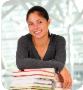
Librarian (and/or TextBook Manager)